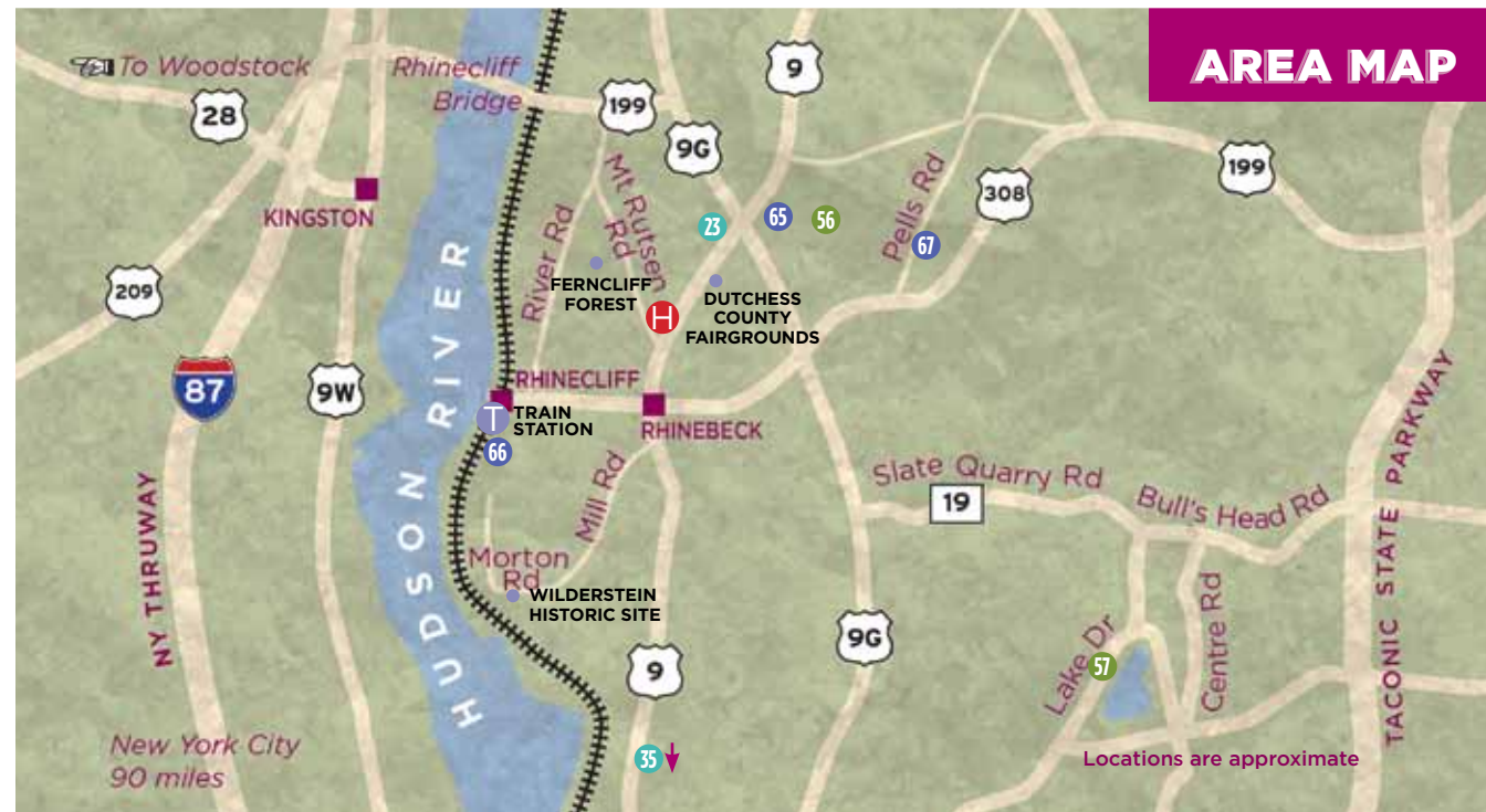
Locations are approximate